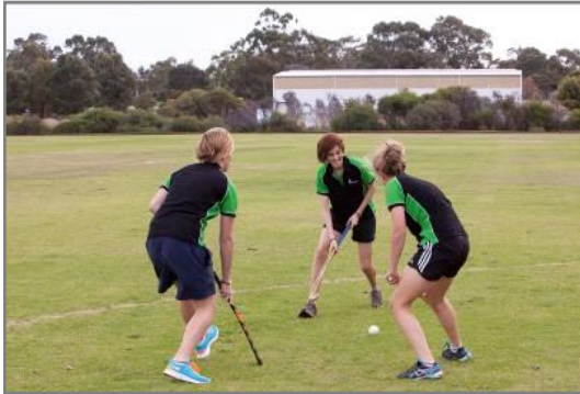
Sport and Recreation