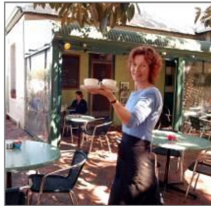
Cafes and restaurants