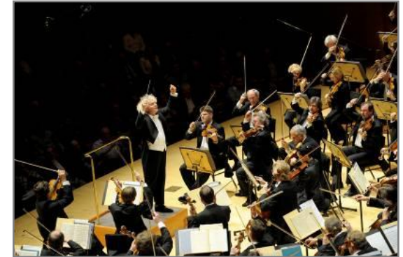
Culture and the Arts