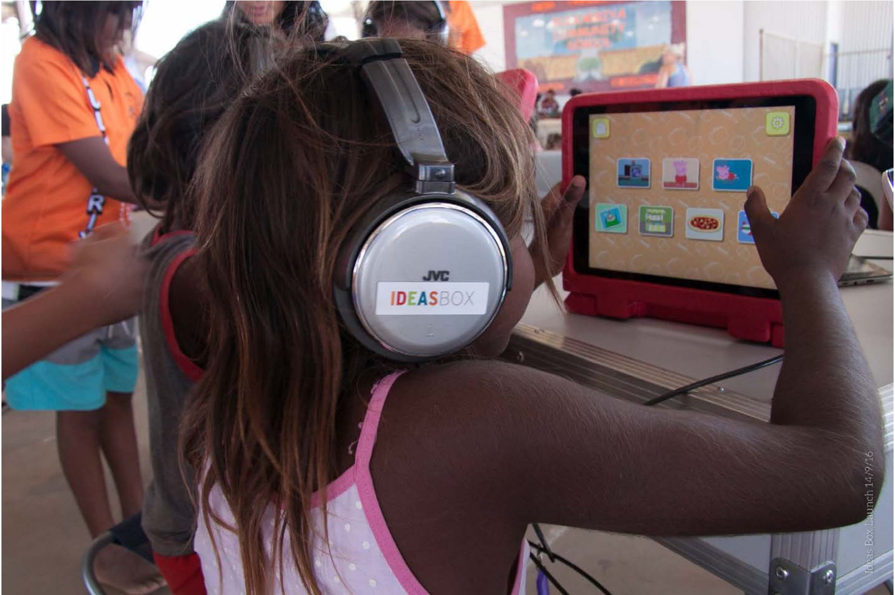
Ideas Box Launch 14/9/16