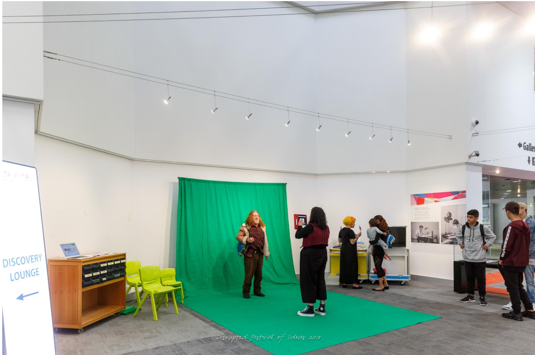
Disrupted Festival of Ideas, 2018