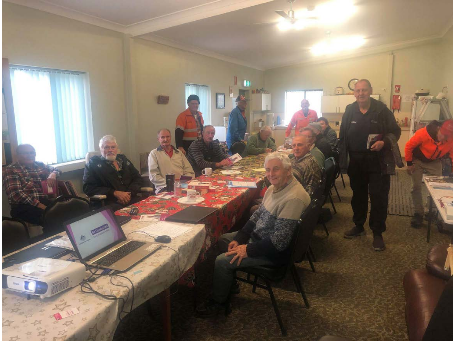
Be Connected Session - Hopetoun