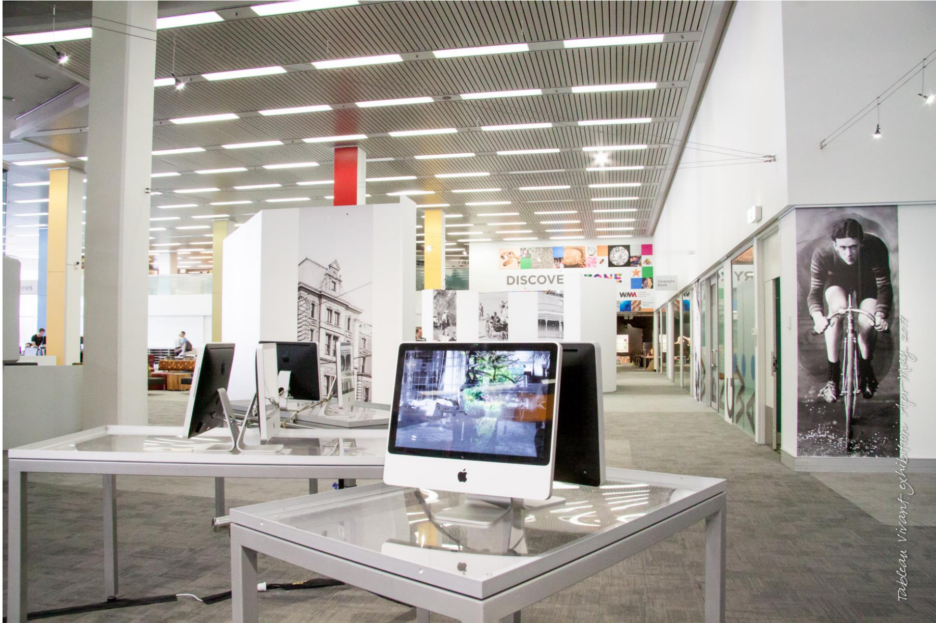
Tableau Vivant exhibitions Apr-May 2011