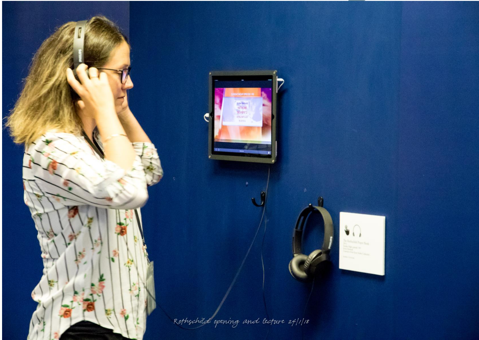
Rothschild opening and lecture 24/1/18