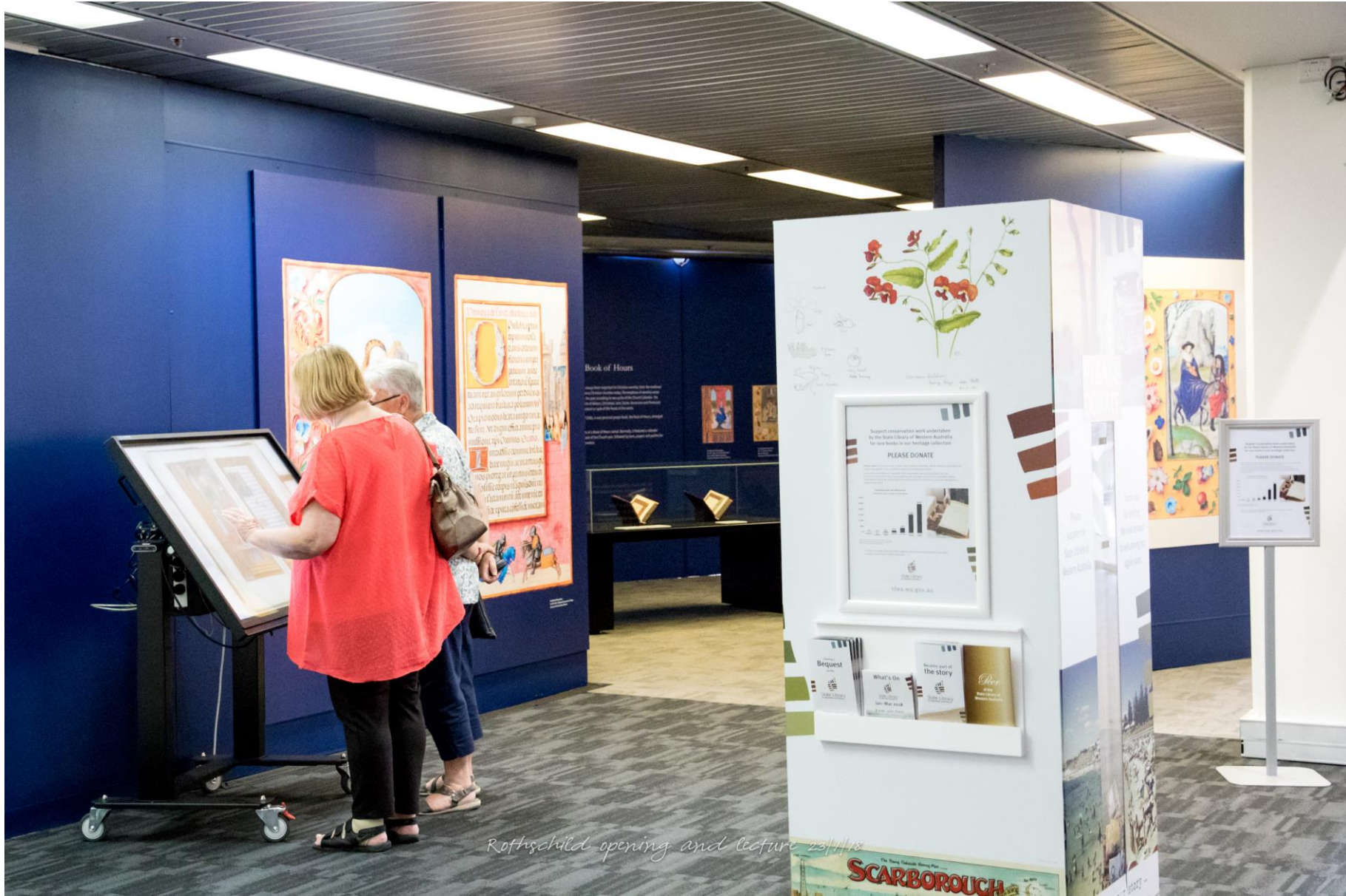
Rothschild opening and lecture 23/1/18