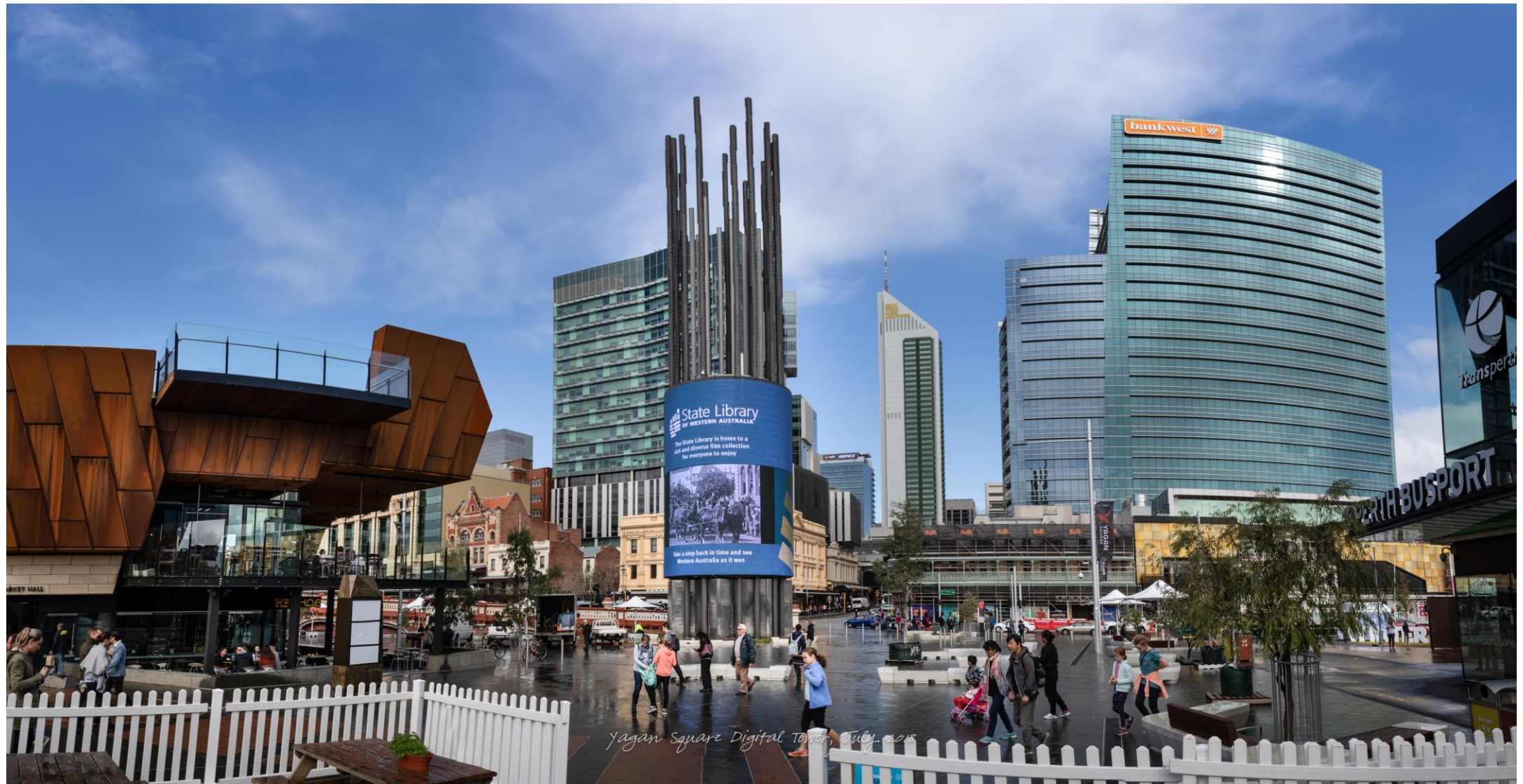
Yagan Square Digital Tower, July 2015