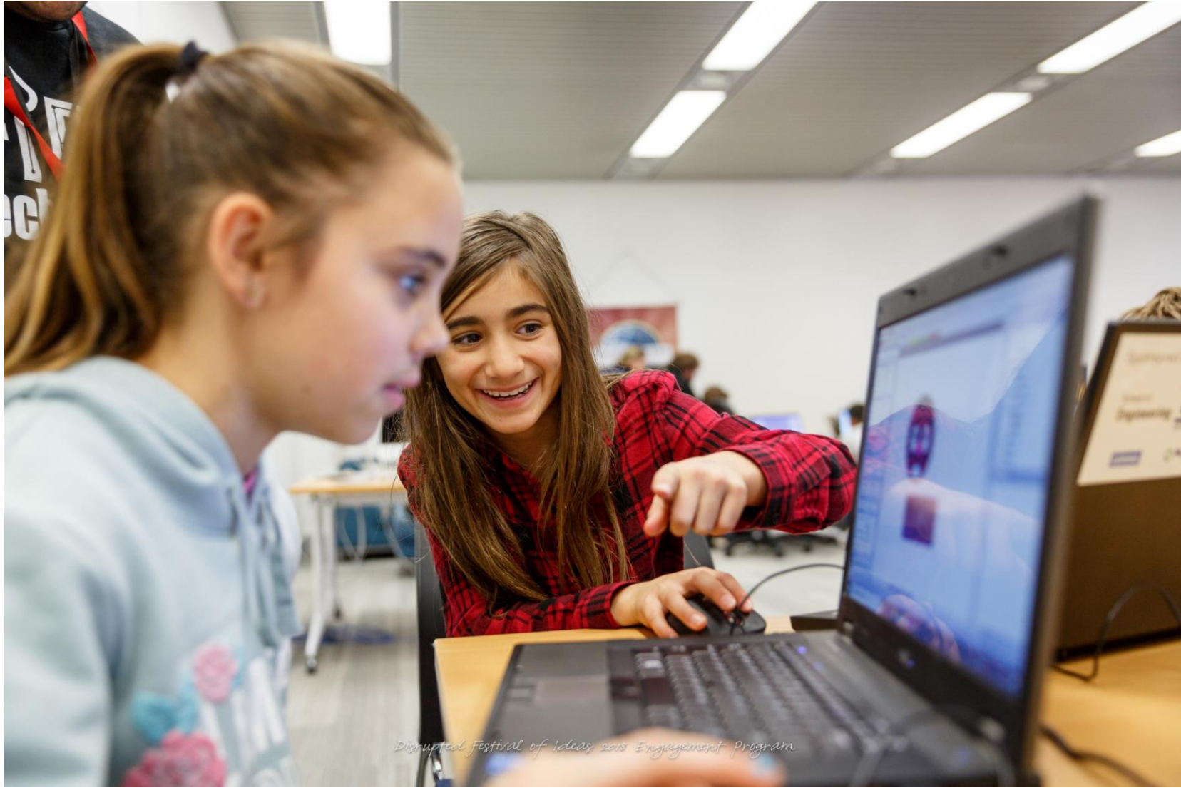
Disrupted Festival of Ideas 2018 Engagement Program