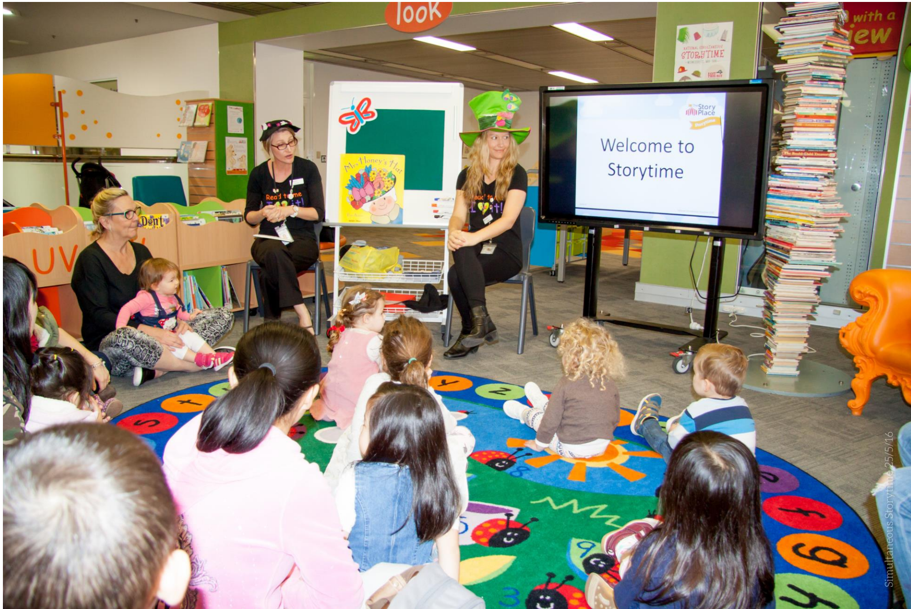
Simultaneous Storytime 25/5/16