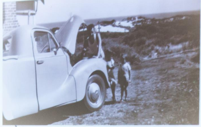
Holiday time at Yallingup Beach