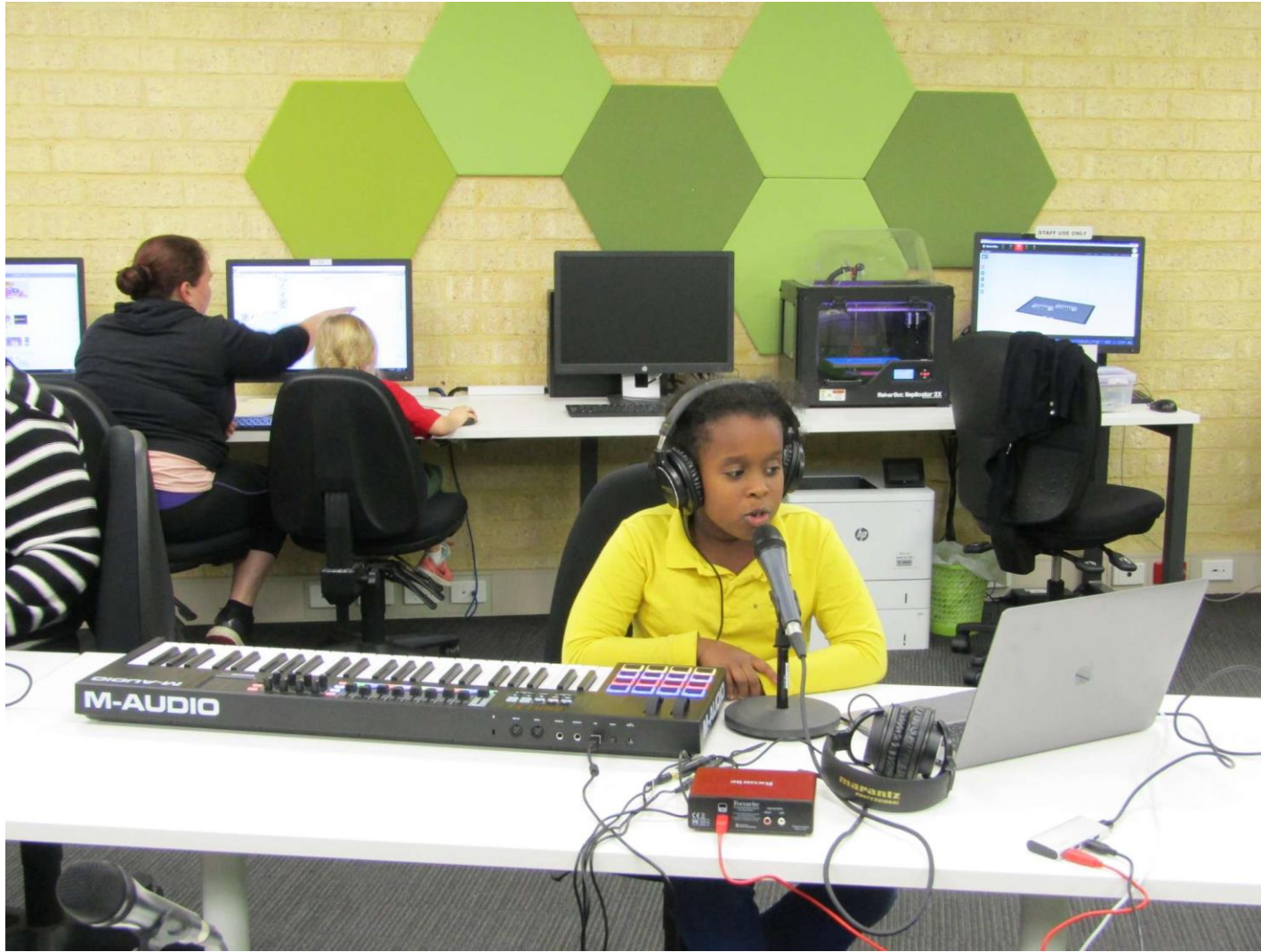
Mirrabooka Public Library