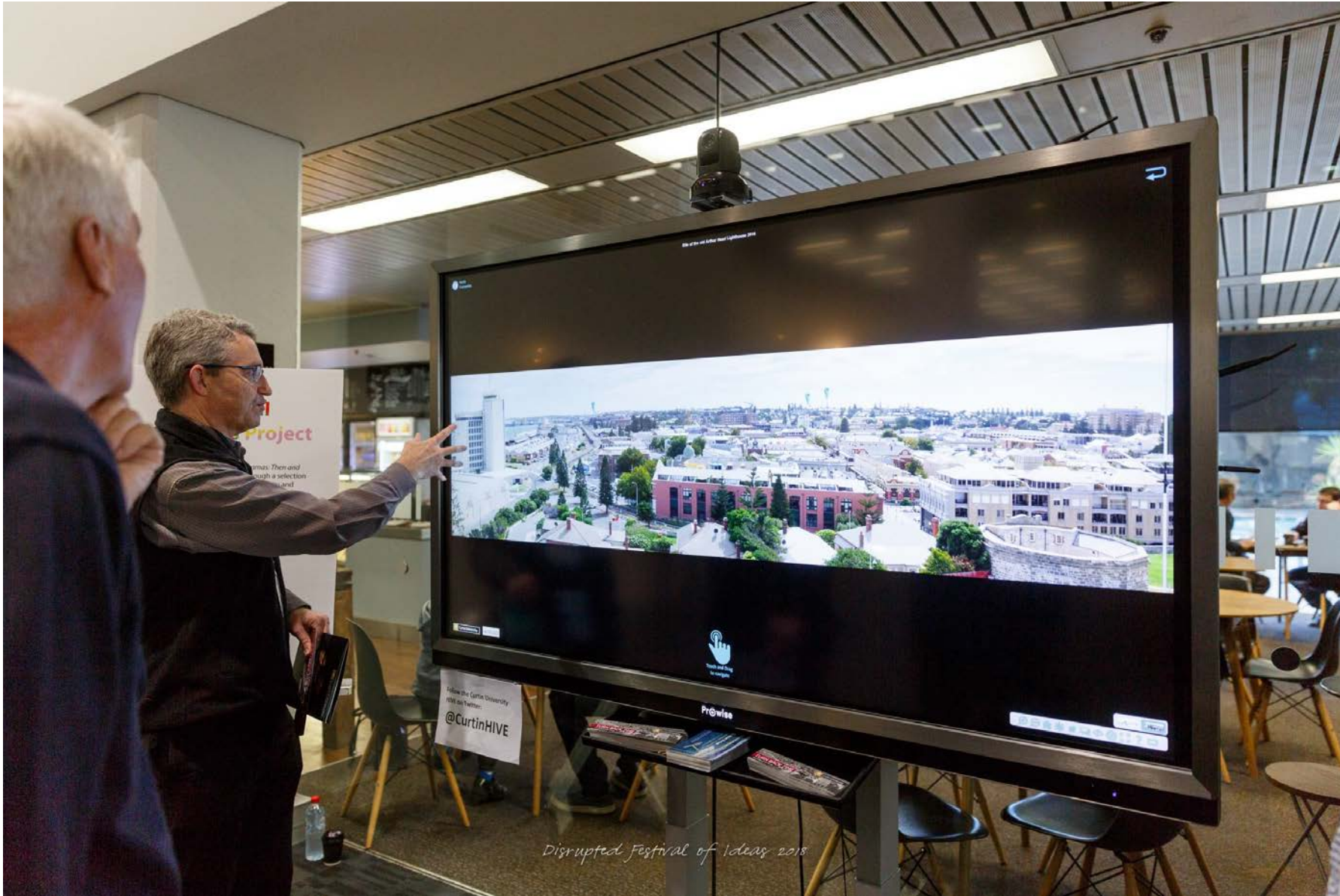
Disrupted Festival of Ideas 2018