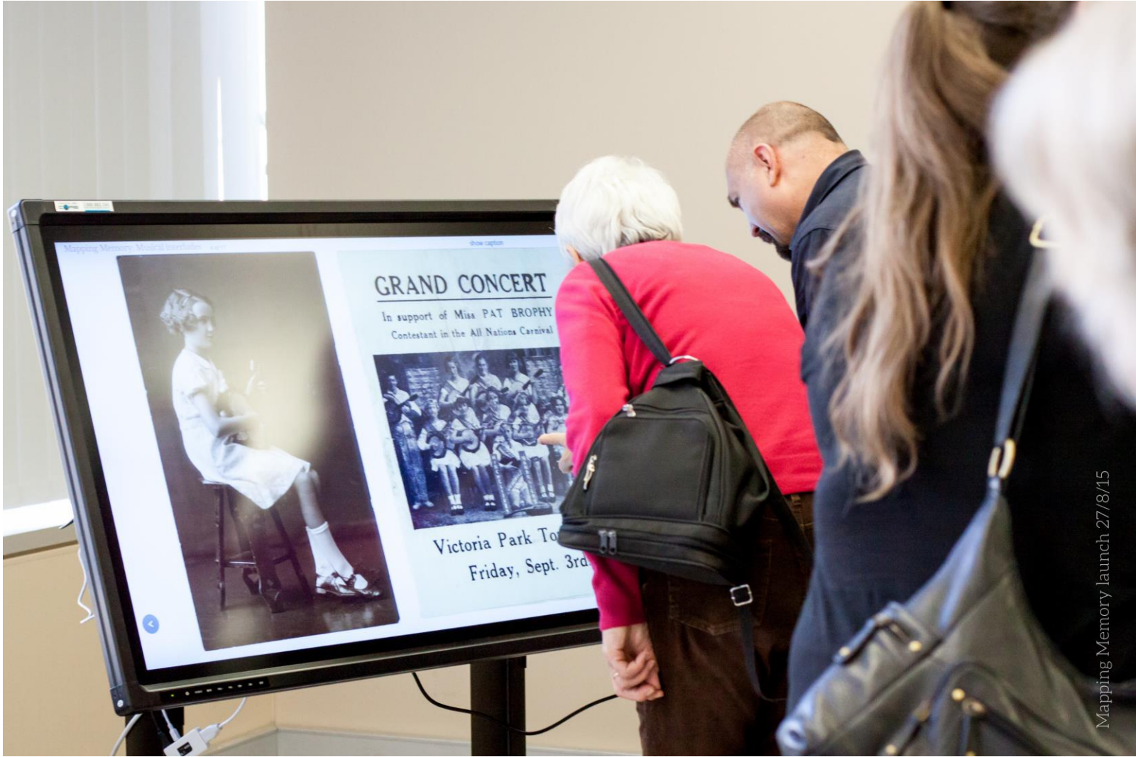
Mapping Memory launch 27/8/15