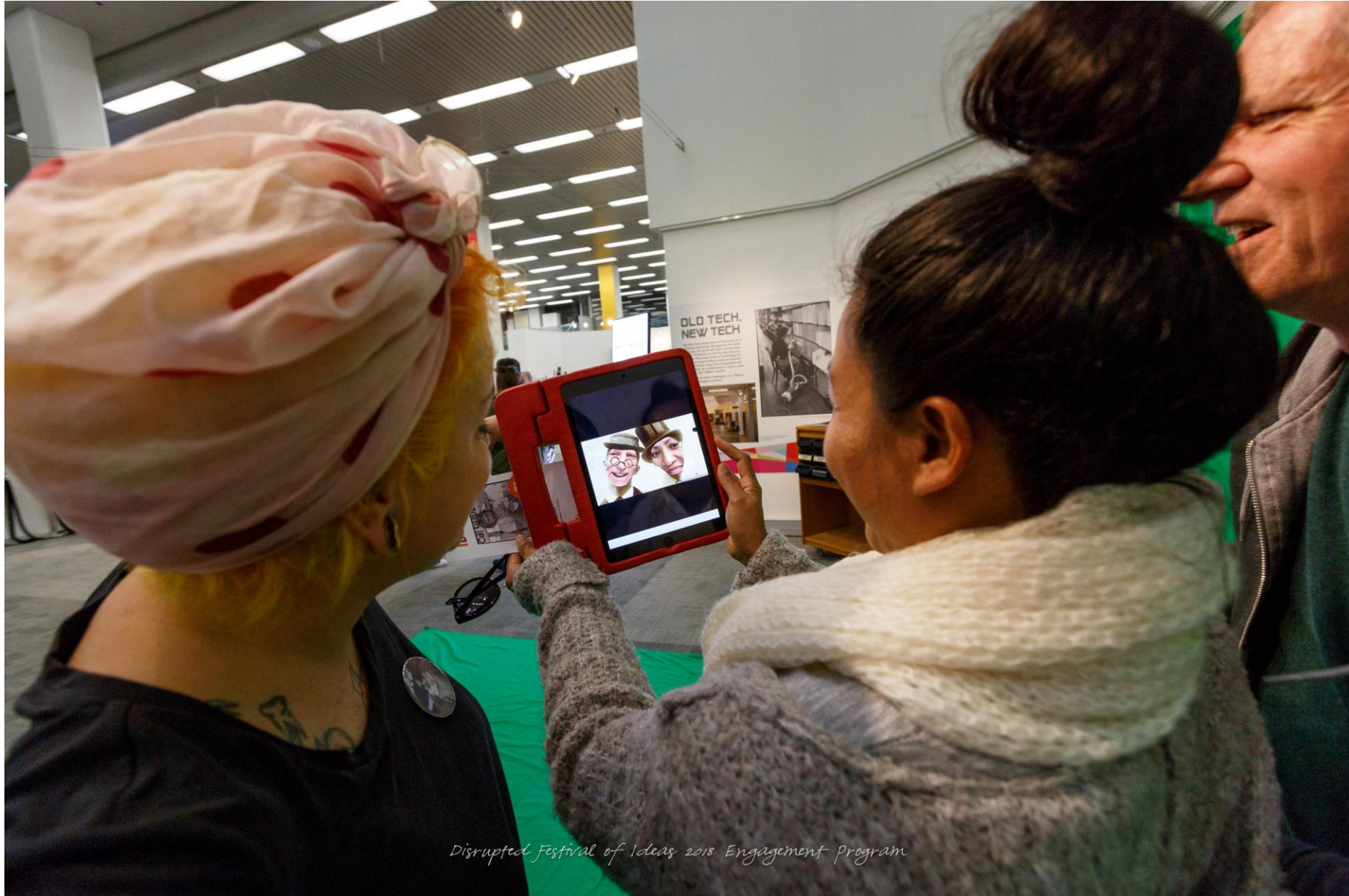
Disrupted Festival of Ideas 2018 Engagement Program