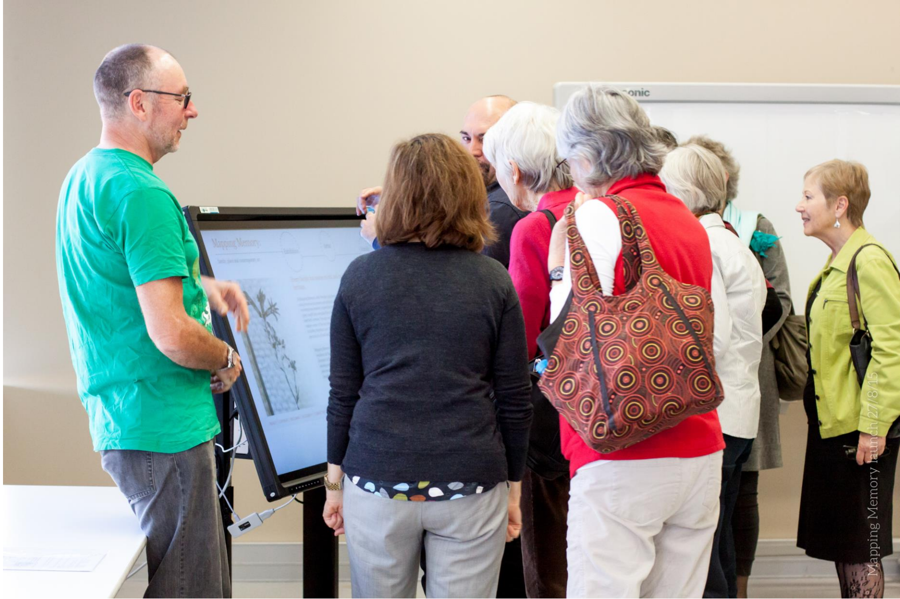
Mapping Memory launch 27/8/15