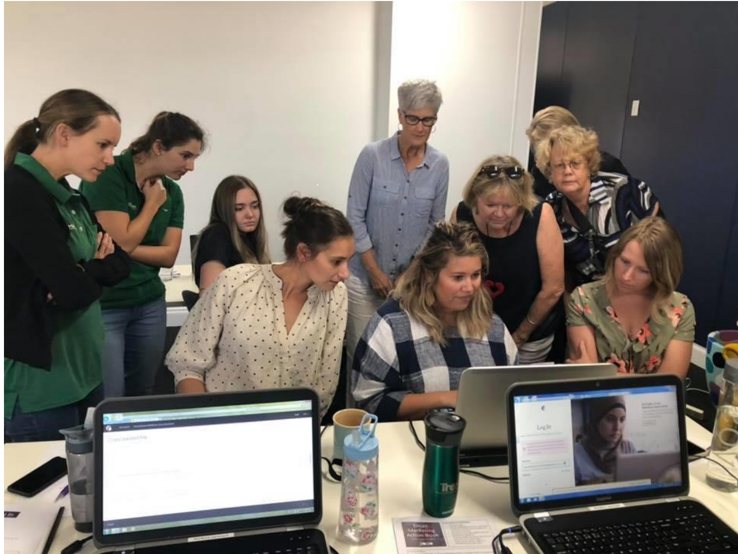
Ravensthorpe Public Library