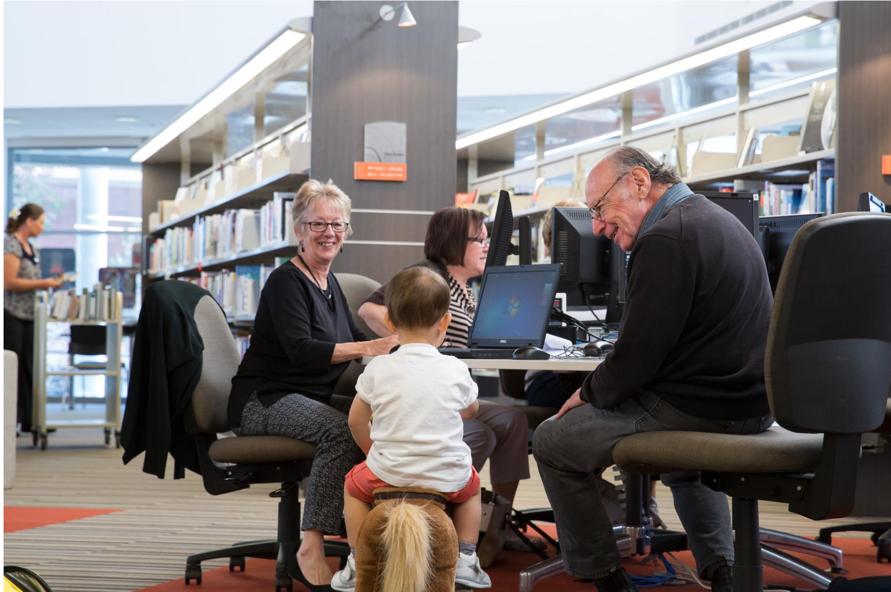
Wanneroo Public Library