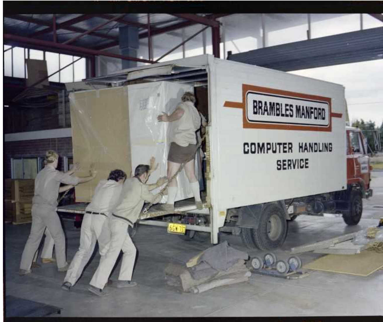
State Library Collection