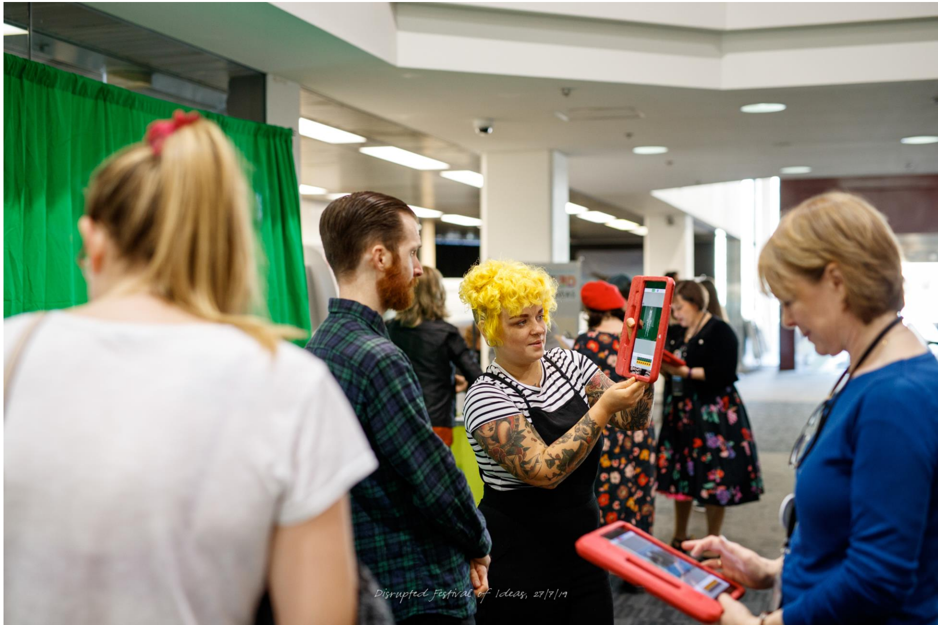
Disrupted Festival of Ideas, 27/7/19